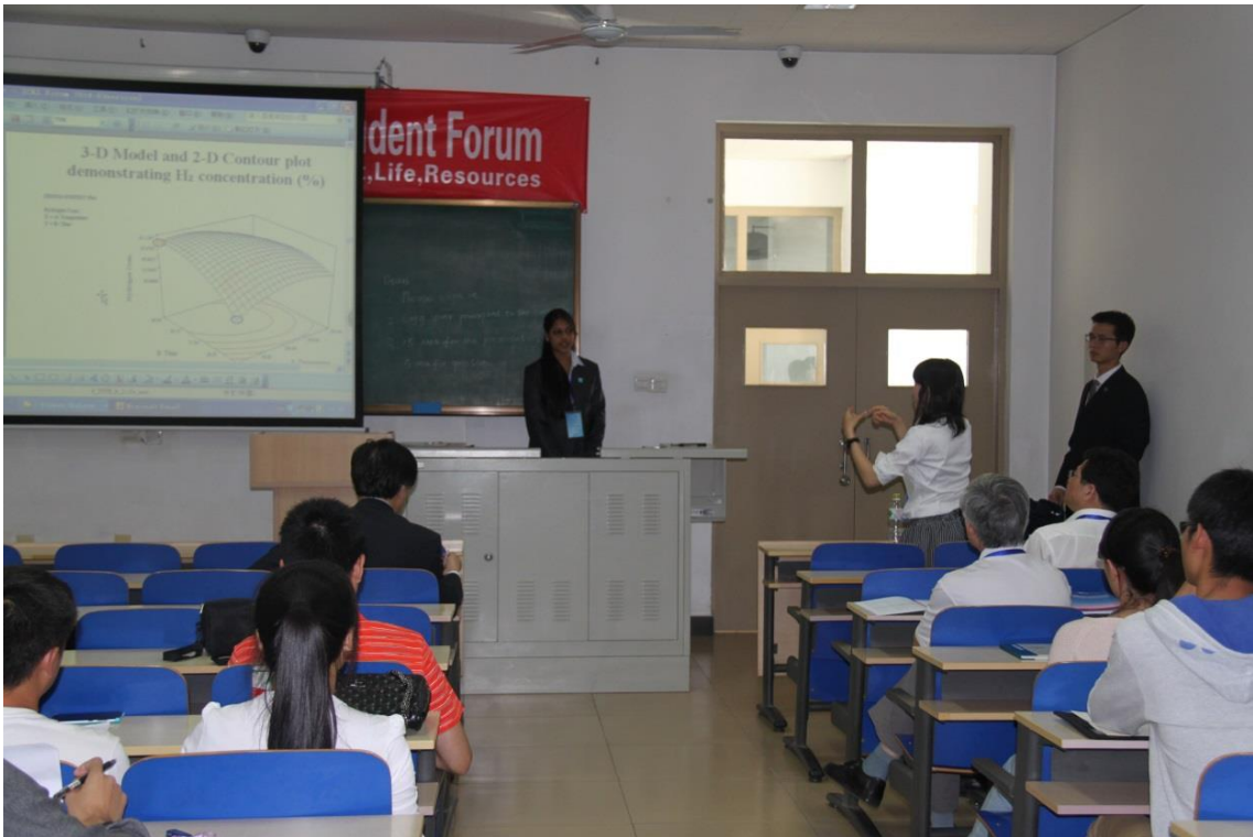
Discussion at the forum.