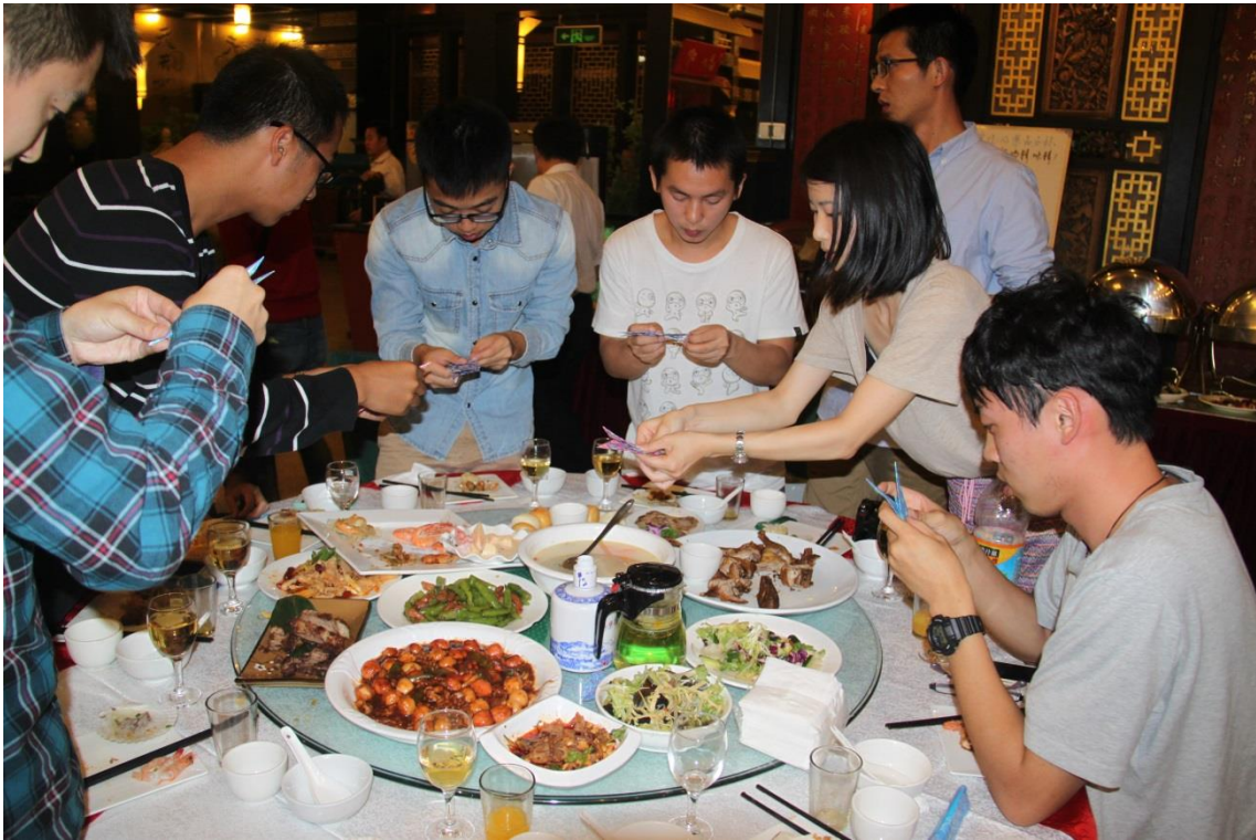
Origami workshop at the farewell party.