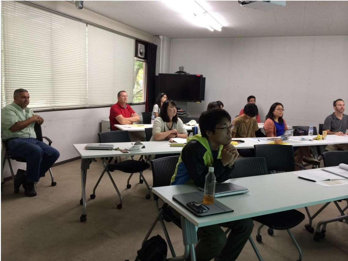
Presentation rehearsal by a student.