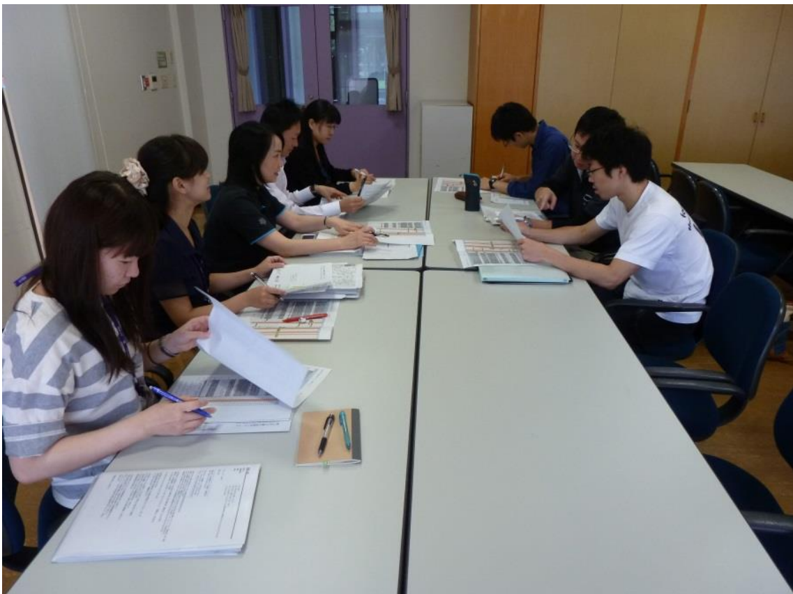
Meeting of the Organizing Committee at UT.