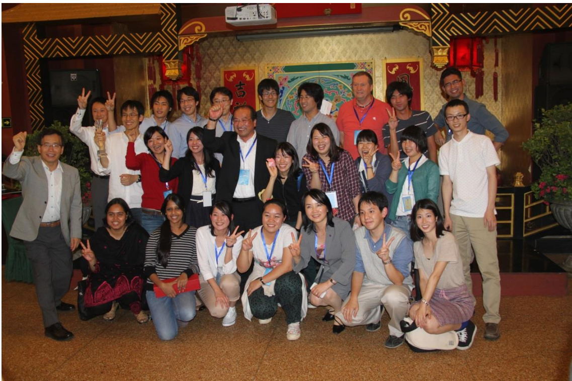
Speakers of the forum.