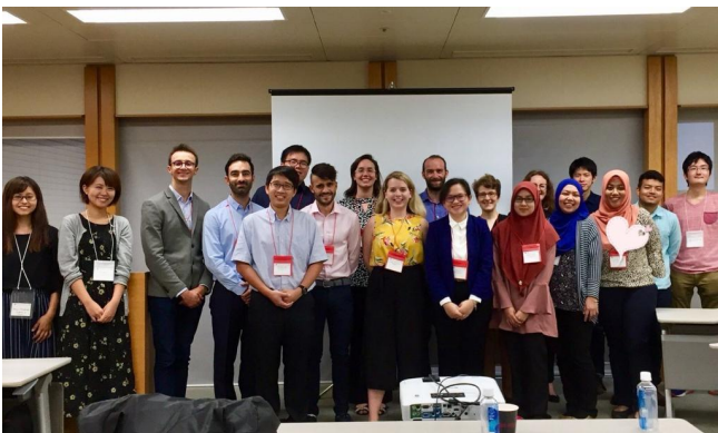
Attending CiC Students' Workshop Session during Tsukuba Global and Science Week 2018 (TGSW2018)

Overall, I have learned how to survive in a foreign country out of reach of my parents and others whom I am familiar with. The people, the culture and the traditions of this country, are all unique. Although I couldn't speak Japanese, Japan has brought a sense of curiosity and excitement while strengthening my knowledge.