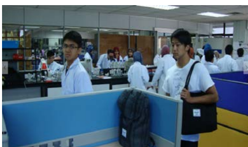
at IOES, UM