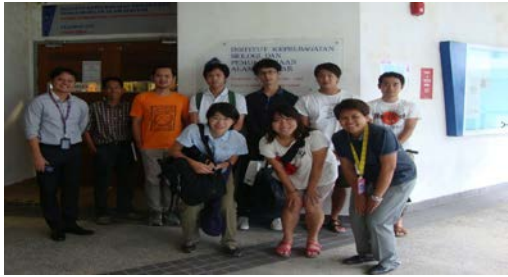
at IBEC, UNIMAS