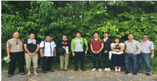
at Bung Jagoi conservation site with IBEC staffs