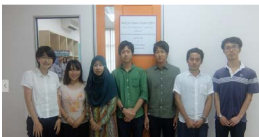
group photo in front of UT KL Office