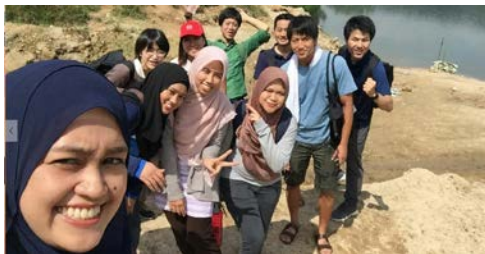
wefie at Batu Dam