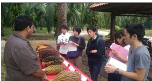
at East Estate Palm Oil Plantation, Carey Island, Selangor